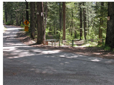
PCT trailhead at junction of Soda Creek Road and Riverside Road (no parking)